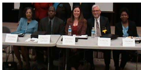
Speakers for the 21 st Century Forum