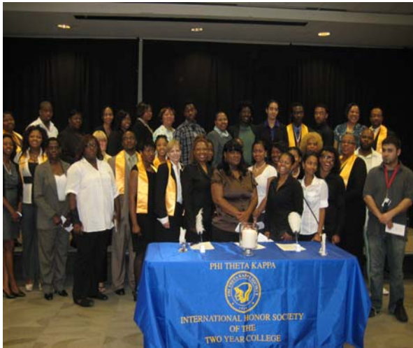
2010-11 Phi Theta Kappa Members

Atlanta Metropolitan College's (AMC) Phi Theta Kappa (PTK) Chapter, Beta Beta Tau, has had an incredible Spring Semester. March saw a record 55 students inducted into the honor society and for the fourth year in a row, we received Five Star Status, the highest award a chapter can receive, for involvement in chapter, college, community, regional and international activities.